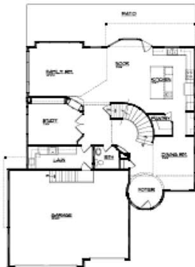
FIRST LEVEL FLOOR PLAN 02/20/11 117