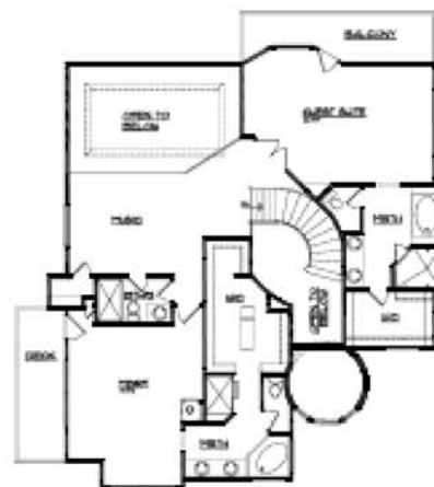
UPPER LEVEL FLOOR PLAN 02/20/11 118